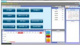
Supporting software for pathological diagnosis (Available for Windows browser)