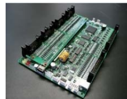
4 axis motor controller with encoder input