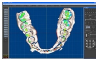
3D interlock simulator