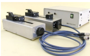
Multiaxial syringe pump delivery system