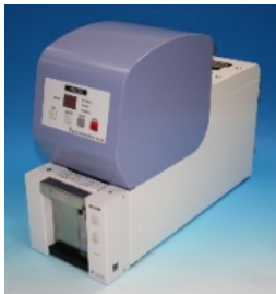
Slide printer (Thermosensitive type)

1. Various devices used for pathological diagnosis, Application soft